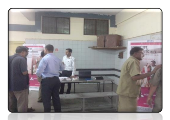
'Asha Home Loan' activity conducted for BEST drivers and conductors at Mumbai

generation activities, which can supplement their overall household income and contribute to improvement in their standard of living. The women form Joint Liability Groups to access micro-loans from the Bank. The women customer along with her spouse is also covered through insurance to manage emergency situations. The initiative is currently active in six states of Bihar, Madhya Pradesh, Uttar Pradesh, Odisha, Karnataka and Maharashtra. The Bank has tieups with Business Correspondents to extend similar micro-loans in the state of Tamil Nadu and Gujarat. During the year, the Bank has launched 'Asha Home Loans' to serve the Low Income Group (LIG) segment. Traditionally, the LIG segment is underserved by commercial banks due to lack of specialised products for them and perceived high risk factors. 'Asha Home Loans' is step towards inclusion of LIG segment to meet the basic needs of shelter by owning a home. The product is tailored to suit the LIG segment with affordable housing