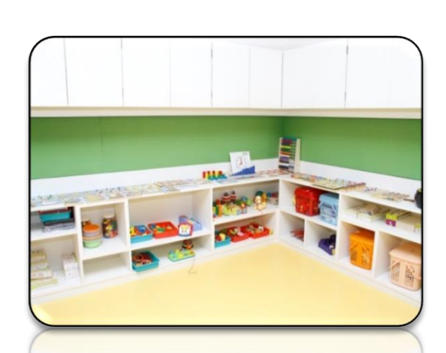
Toy section at 'Little Steps', crèche set up at the Bank's Corporate Office in Mumbai

In order to sensitize employees on safe & ethical workplace behaviour, the Bank besides conducting Town-Hall/Awareness sessions for Senior Leaders and Branch Heads, also has conducted theatre workshops / road shows for all employees across the organization. The Bank launched an umbrella program Fit & Fine in 2014 to provide employees with the opportunity to pursue their health, fitness, sports, and recreational interests. Under the Fit & Fine program, various Central and Regional level programs are anchored such as Stepathlon, Marathon, free screenings for common diseases, health talks by clinical specialists, sports training, hobby clubs, etc. The Bank has tied up with Striders, an agency providing specialized training to aspiring marathon athletes. To encourage the culture of walking and promote wellness, the Bank has put into place various sponsorship schemes for Stepathletes with top scores, most