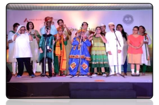
SPJ Sadhana students' Republic Day performance at Corporate office, Mumbai.