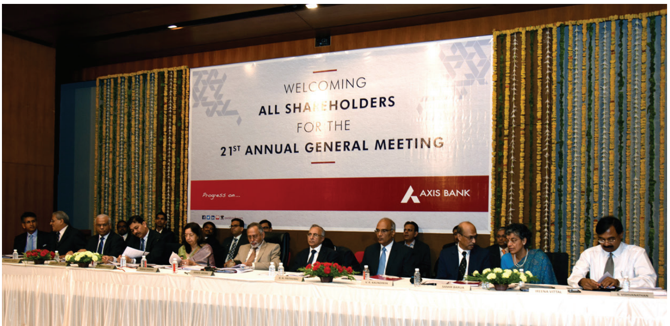
Axis Bank's Board of Directors at the 21 st Annual General Meeting

Scan the QR code to access Corporate Governance section of our Annual Report 2015-16