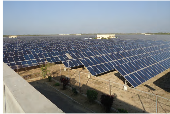
TPREL solar panel installations