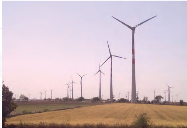
TPREL wind turbines

across 10 provinces in India. Tata Power group's goal is to achieve 30%-40% of power generation capacity from non-fossil fuel based sources