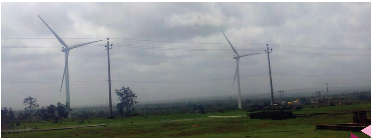
Windmill installed at Doddanavar Global Energy

The group has already commissioned a 15MW wind energy project and are in process to commission another 32 MW wind energy project.