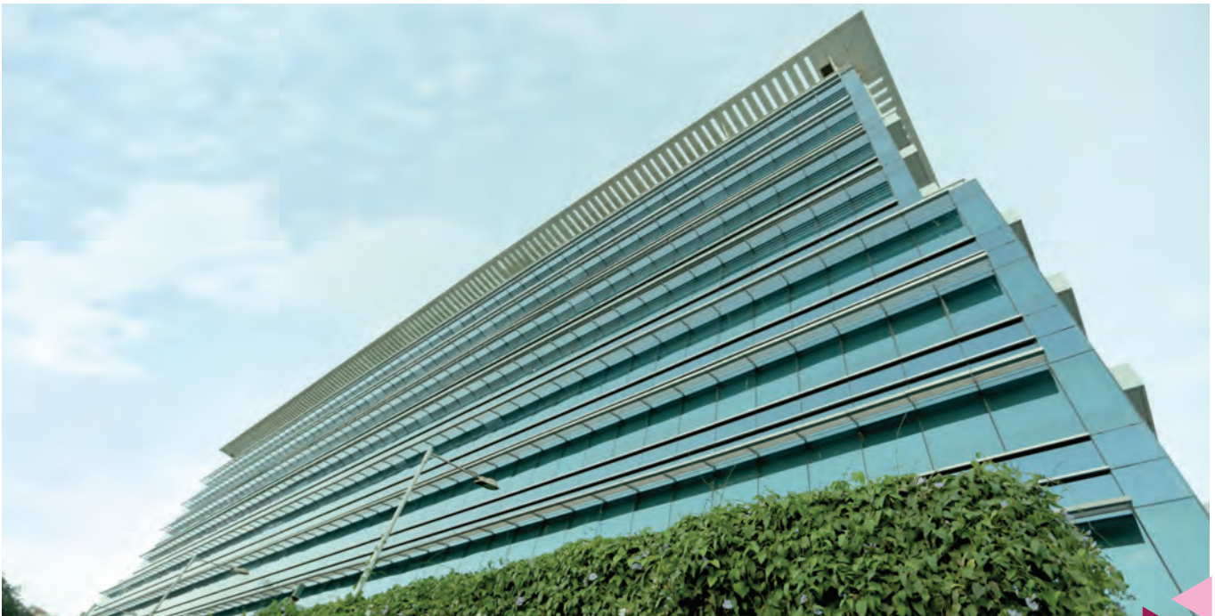
Axis House, Mumbai

Apart from the Head Office, preference is also given for green features in the leased premises for our branches and other offices. Overall Axis bank has 5 MW of rooftop solar capacity. We have installed total of 5 MW of solar energy across all our operations which translates to an annualized reduction in emissions of 3,377 tCO 2 e.